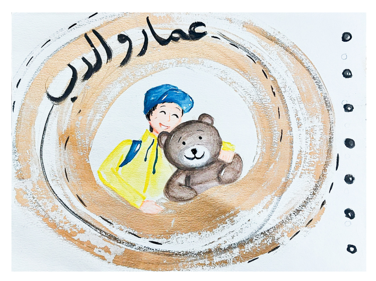
Ammar and the Bear