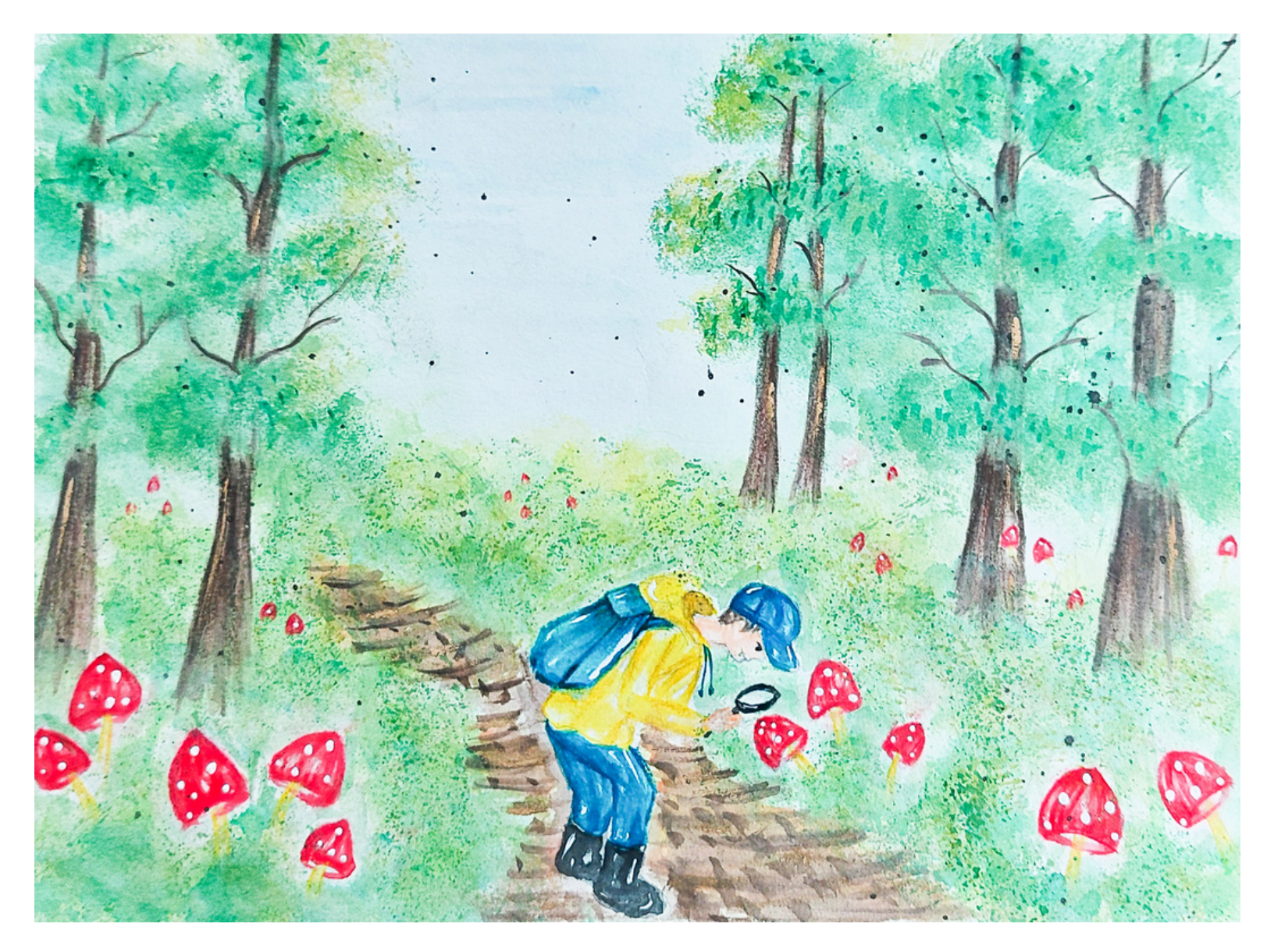
Once upon a time, there was a boy named Ammar who loved adventures very much.