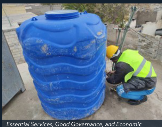
Essential Services, Good Governance, and Economic Recovery, Northeast Syria

525 Syrian students received mentorship in Jordan