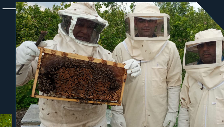
Smart Desert, Jordan

11,000+ people impacted by community rehabilitation plans in Colombia