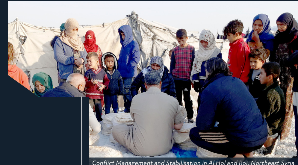
Conflict Management and Stabilisation in Al Hol and Roj, Northeast Syria

*Survey respondents represent 285 of the 576 HBBs supported by Blumont since 2019.