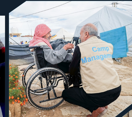
SAFER III, Northeast Syria