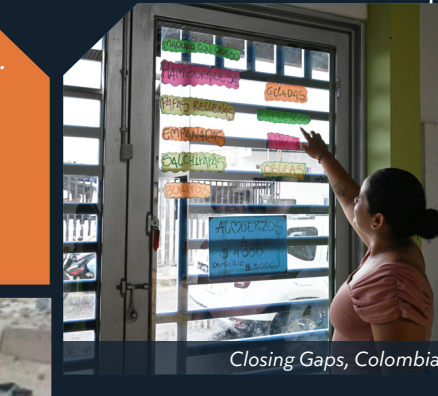
Closing Gaps, Colombia